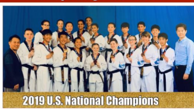
2019 U.S. National Champions